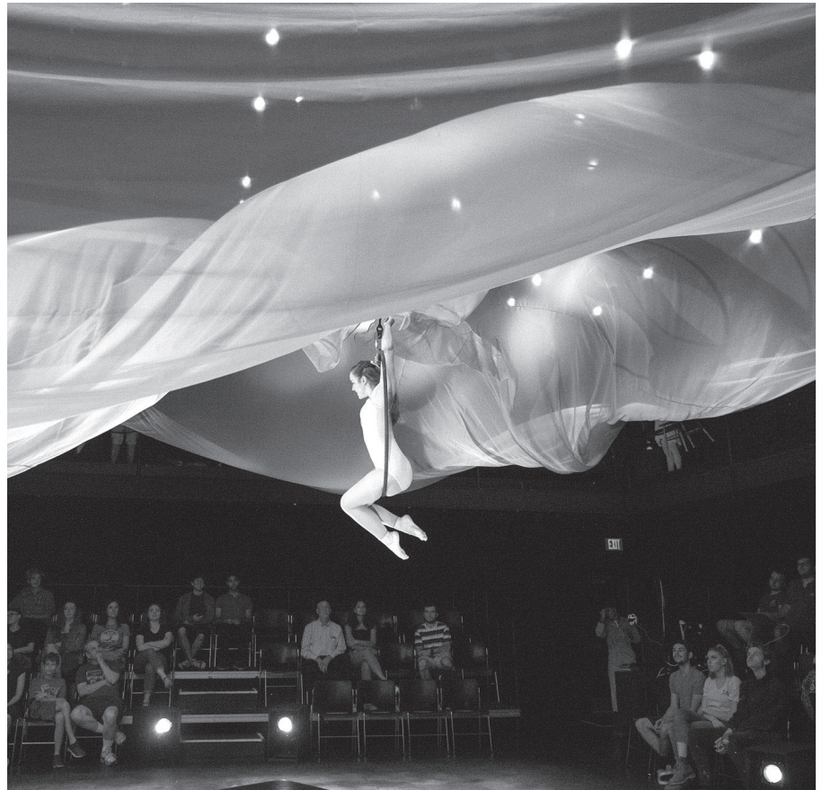
BOHEMIA at Muhlenberg College, Allentown

THRU 5/12: Carrie Mae Weems: Strategies of Engagement. Experience immersive installations and